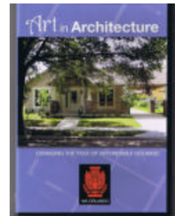
"Art in Architecture, changing the face of affordable housing" by AIA Orlando in conjunction with Orlando Regional Realtors Association

If you are interested in viewing this DVD at your office or in a local Society meeting, please contact the AIA Montana Office to check it out for 2 week periods on a first come first out process. It is very good!